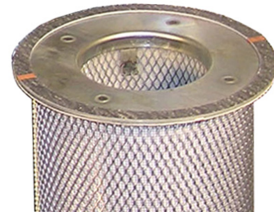
Integrated Anti-Static Grounding Connections